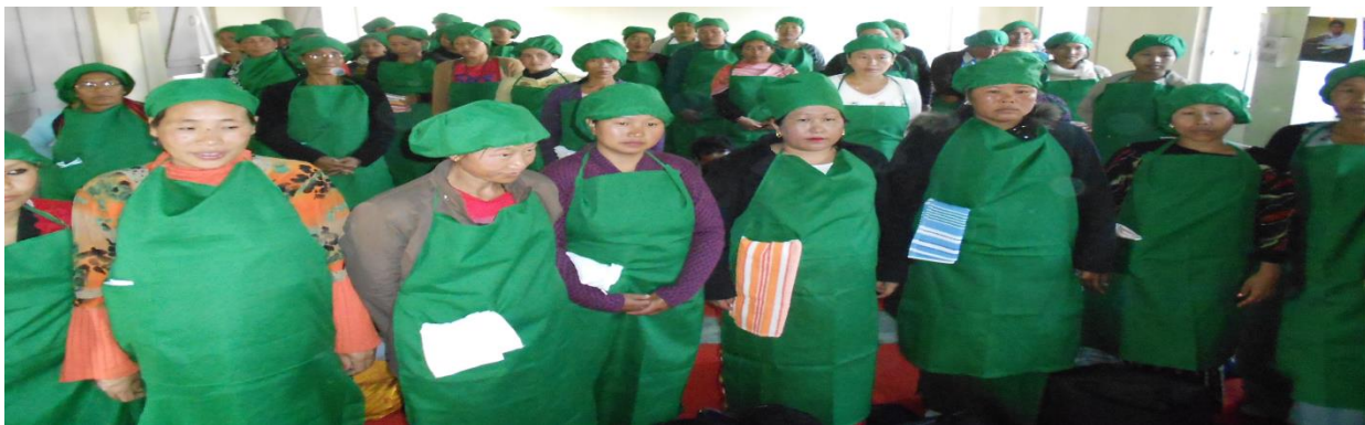
Participants with their aprons and head scarfs