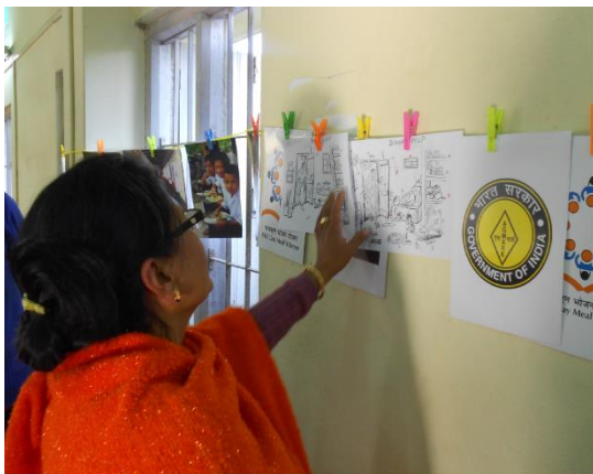
During discussion on good and bad Kitchen