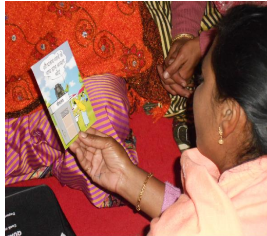
One of the participants holding the pictorial post