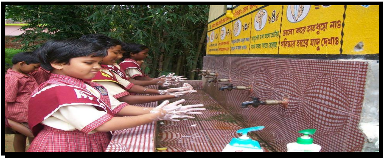
GARHBETA-I Block, Paschim Medinipur

10. Hand Washing:- Hand washing with soap is being followed in all the schools before taking MDM.