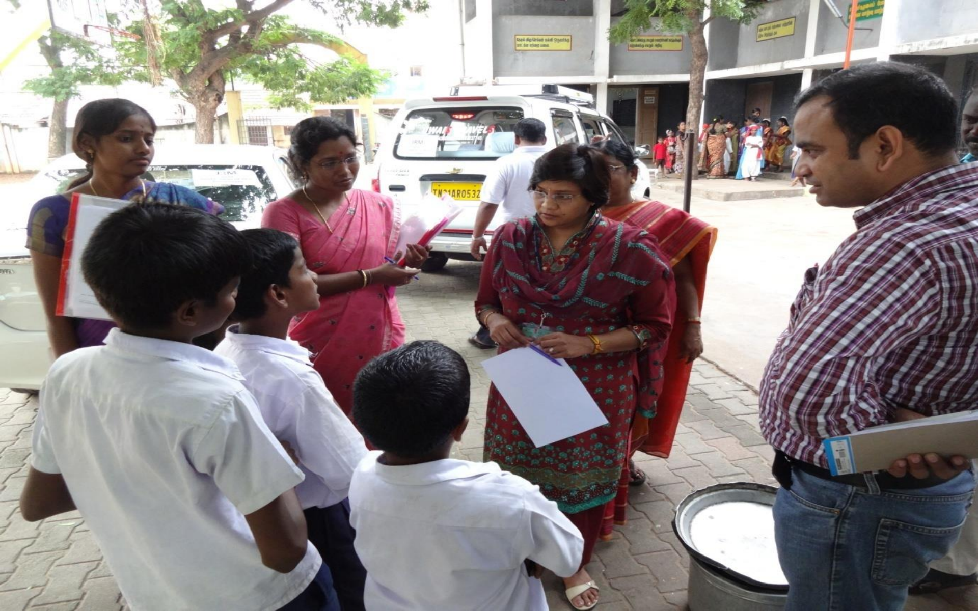
MHRD OFFICIALS & JOINT REVIEW MISSION INTERACT WITH THE STUDENTS